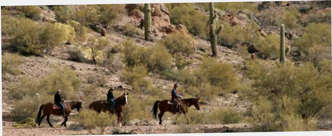
Flying E Ranch Riders