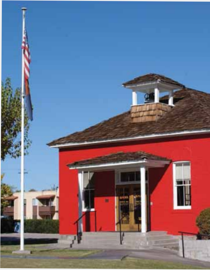
Garcia Little Red School House